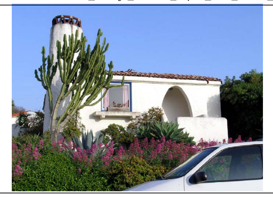
P11. Report Citation: None.

P4. Resources Present: ☐ Building ☐ Structure ☐ Object ☐ Site ☐ District ☐ Element of District ☐ Other