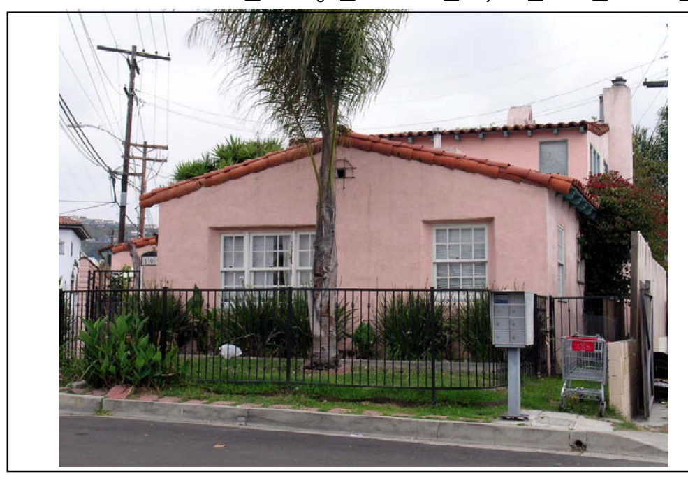
P11. Report Citation: None.

P4. Resources Present: ☐ Building ☐ Structure ☐ Object ☐ Site ☐ District ☐ Element of District ☐ Other