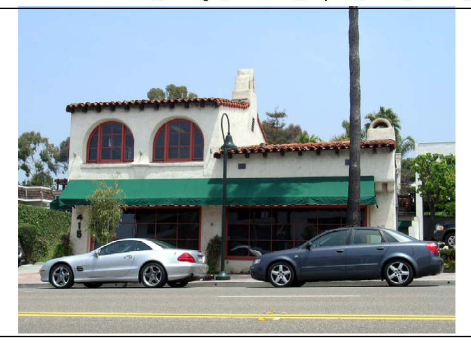
P11. Report Citation: None.

P4. Resources Present: ☑ Building ☐ Structure ☐ Object ☐ Site ☐ District ☑ Element of District ☐ Other