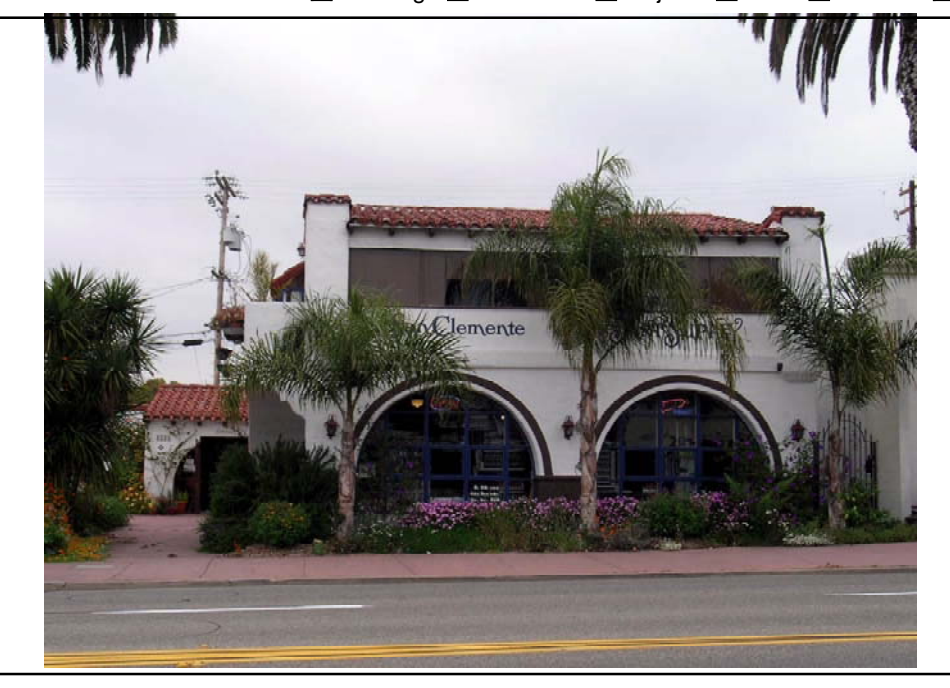
P11. Report Citation: None.

P4. Resources Present: ☐ Building ☐ Structure ☐ Object ☐ Site ☐ District ☐ Element of District ☐ Other