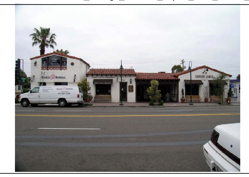
P11. Report Citation: None.

P4. Resources Present: ☑ Building ☐ Structure ☐ Object ☐ Site ☐ District ☑ Element of District ☐ Other