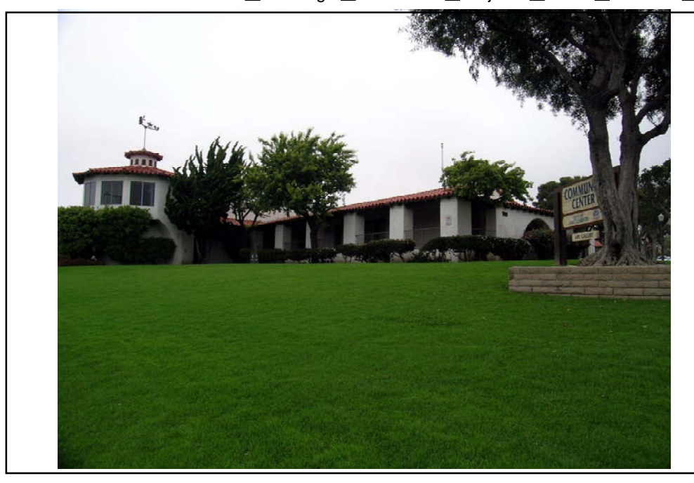
P11. Report Citation: None.

P4. Resources Present: ☑ Building ☐ Structure ☐ Object ☐ Site ☐ District ☑ Element of District ☐ Other