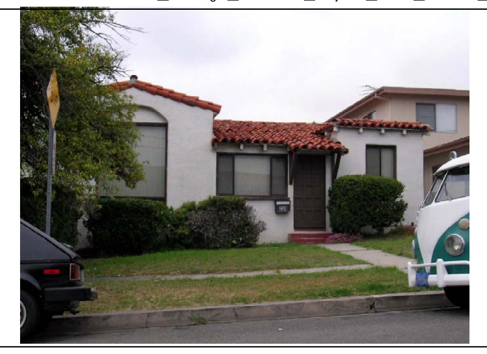
P11. Report Citation: None.

P4. Resources Present: ☑ Building ☐ Structure ☐ Object ☐ Site ☐ District ☑ Element of District ☐ Other