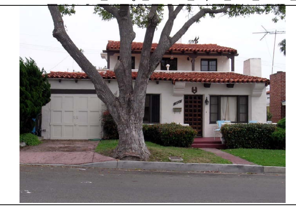
P11. Report Citation: None.

P4. Resources Present: ☐ Building ☐ Structure ☐ Object ☐ Site ☐ District ☐ Element of District ☐ Other