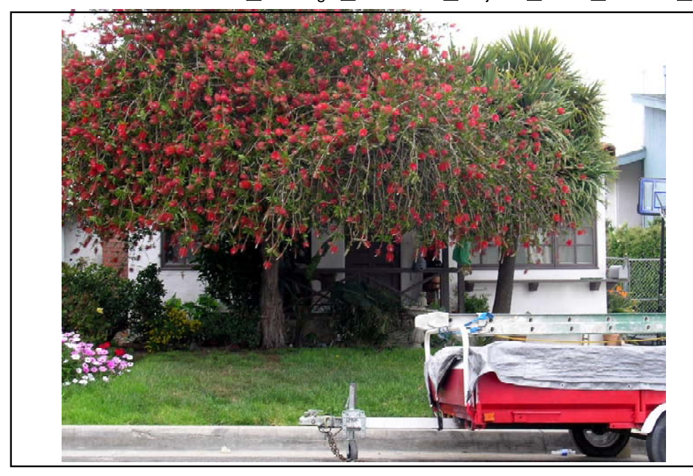
P11. Report Citation: None.

P4. Resources Present: ☐ Building ☐ Structure ☐ Object ☐ Site ☐ District ☐ Element of District ☐ Other