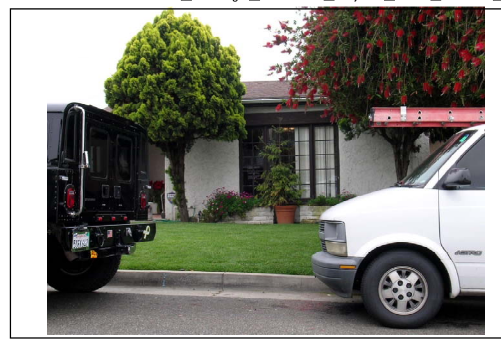
P11. Report Citation: None.

P4. Resources Present: ☑ Building ☐ Structure ☐ Object ☐ Site ☐ District ☑ Element of District ☐ Other