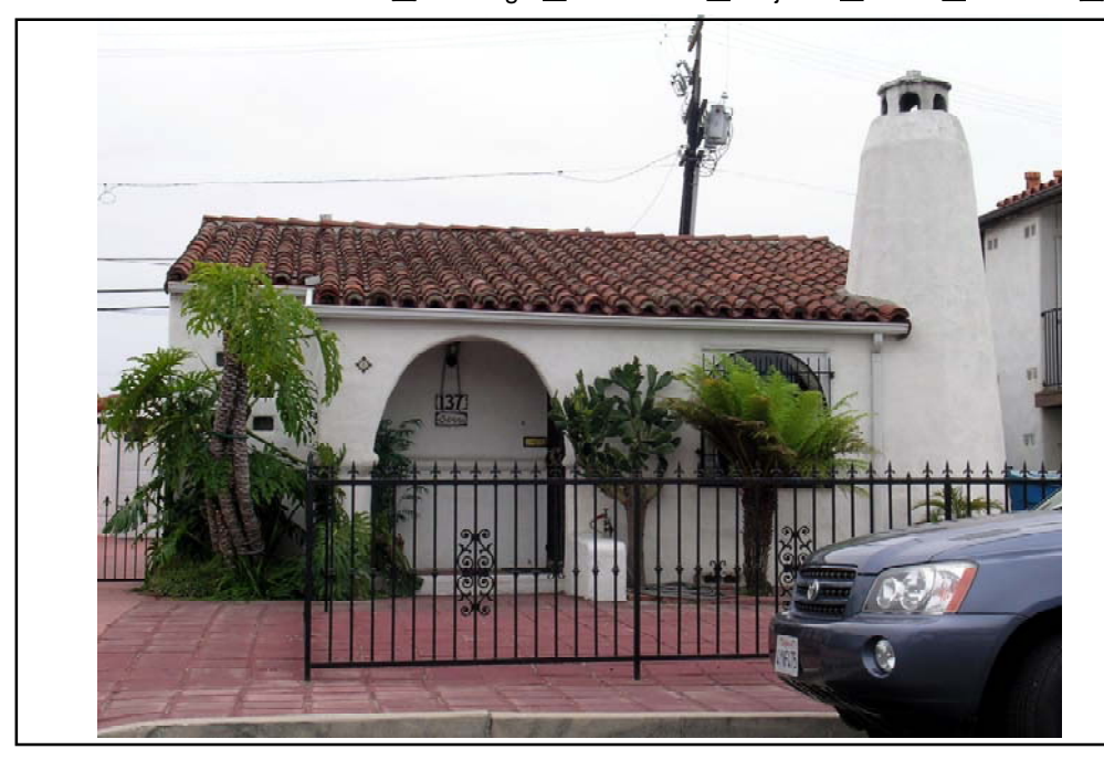
P11. Report Citation: None.

P4. Resources Present: ☑ Building ☐ Structure ☐ Object ☐ Site ☐ District ☑ Element of District ☐ Other