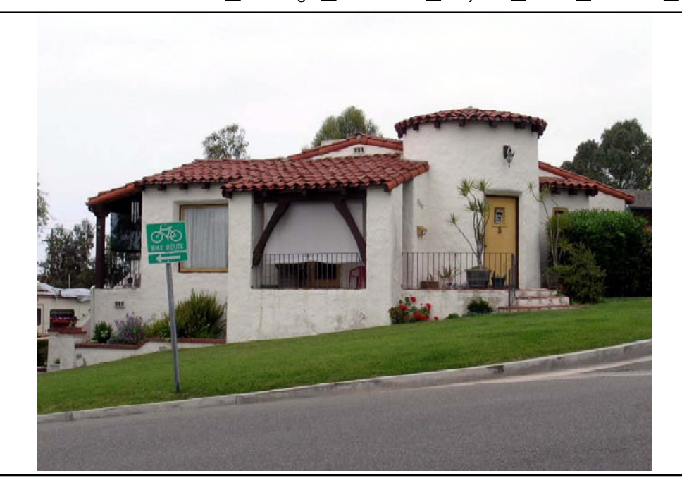
P11. Report Citation: None.

P4. Resources Present: ☑ Building ☐ Structure ☐ Object ☐ Site ☐ District ☑ Element of District ☐ Other