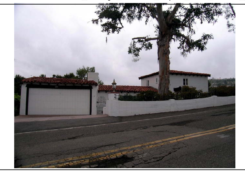
P11. Report Citation: None.

P4. Resources Present: ☐ Building ☐ Structure ☐ Object ☐ Site ☐ District ☐ Element of District ☐ Other