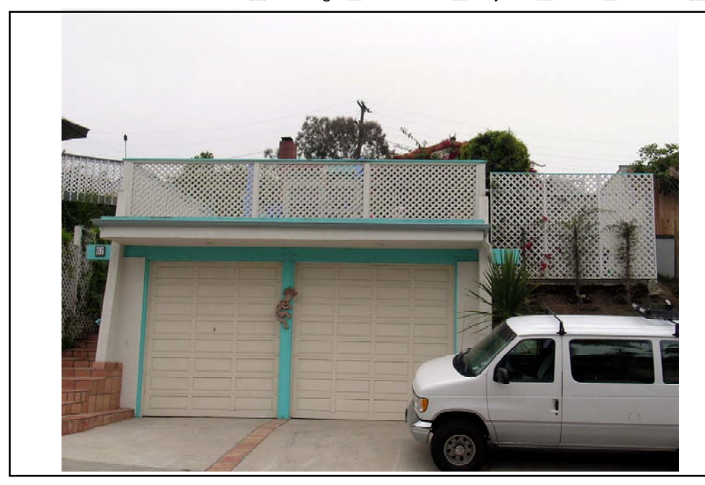
P11. Report Citation: None.

P4. Resources Present: ☐ Building ☐ Structure ☐ Object ☐ Site ☐ District ☐ Element of District ☐ Other