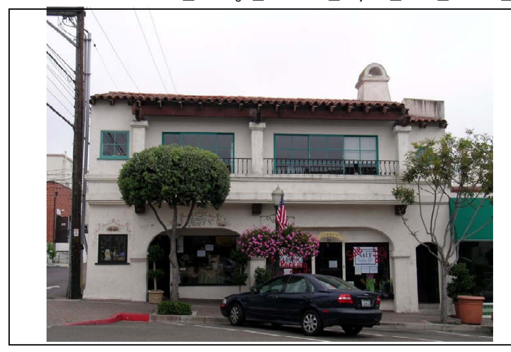
P11. Report Citation: None.

P4. Resources Present: ☑ Building ☐ Structure ☐ Object ☐ Site ☐ District ☑ Element of District ☐ Other